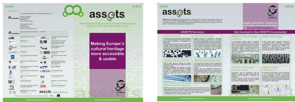
Figure 12 ASSETS Brochure