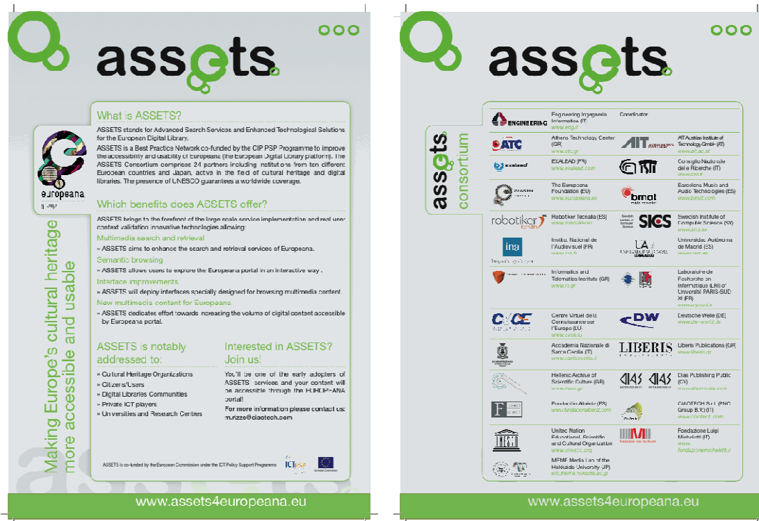
Figure 11 First ASSETS Flyer realised at M3