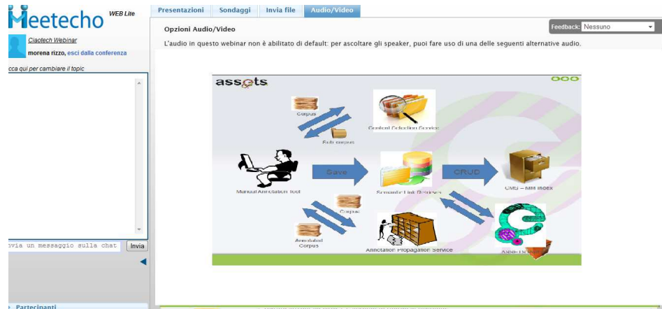
Figure 5 ASSETS webinar interface