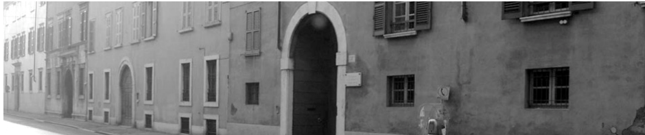
Figure 3 The Fondazione Luigi Micheletti

The 23 rd of March in Brescia at Fondazione Luigi Micheletti , the ASSETS Workshop New services for Museums and Digital Archives was held.