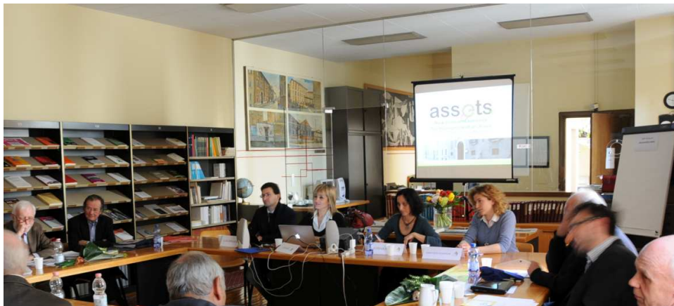
Figure 4 A moment of discussion

16.30 Discussion and services evaluation (ALL)